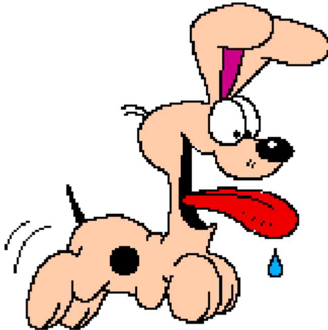
Figure 1.1: Odie the happy dog.

\begin{figure}[H] \centerline{\epsfig{file=odie.eps,width=0.6\linewidth}} \caption{\small Odie the happy dog.} \label{odie} \end{figure}