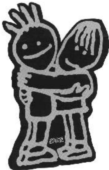
Figure 1.2: A pair of famous DJ.